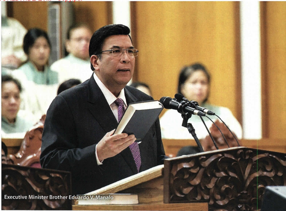
Executive Minister Brother Eduardo V. Manalo