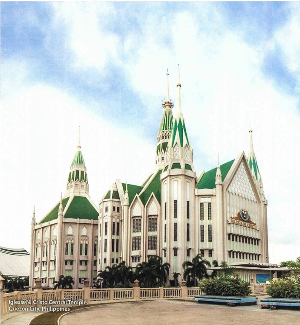
Iglesia Ni Cristo Central Temple, Quezon City, Philippines

The Iglesia Ni Cristo (Church Of Christ) is a Christian religion whose primary purpose is to serve and worship the Almighty God based on His teachings recorded in the Bible. It is not a denomination or sect. It is neither affiliated to any federation or religious bodies nor itself an assembly of smaller churches or religious organizations. This Church is for every one who heeds the call of God and embraces its faith—regardless of one’s race, nationality, cultural background, social standing, economic status, and educational attainment.