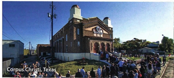
Corpus Christi, Texas