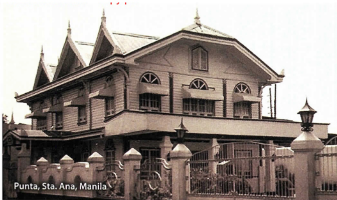
Punta, Sta. Ana, Manila