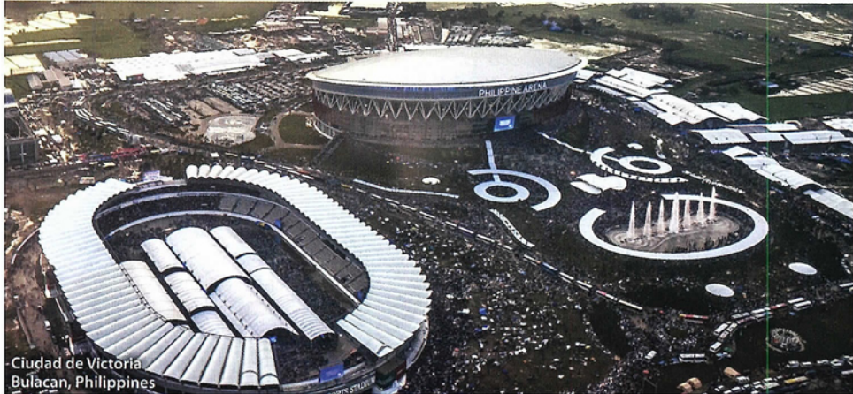
Ciudad de Victoria Bulacan, Philippines

THE CHURCH TODAY. The Iglesia Ni Cristo has an international membership comprising 128 racial and ethnic backgrounds. It maintains nearly 6,000 congregations and missions grouped into 135 ecclesiastical districts in about 100 countries and territories in the six inhabited continents of the world.