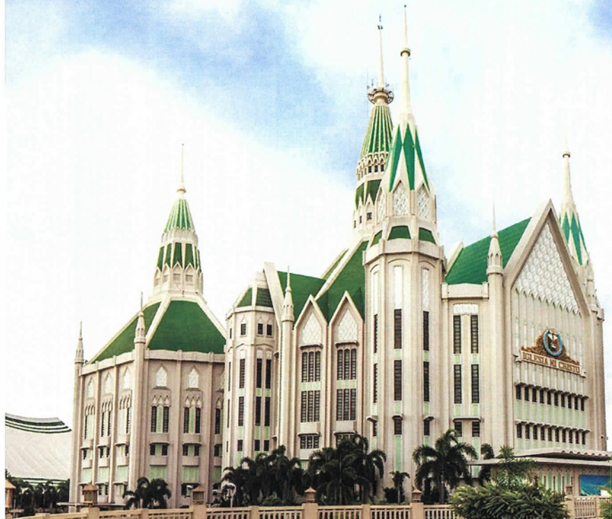
Iglesia Ni Cristo Central Temple, Quezon City, Philippines