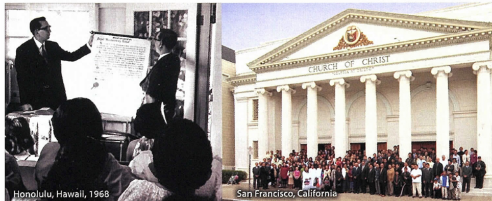
Honolulu, Hawaii, 1968

On July 21, 2014, the Iglesia Ni Cristo inaugurated the Philippine Arena, currently the world’s “largest mixed-use indoor theatre.” This megastructure that sits in Ciudad de Victoria, Bocaue, Bulacan was the venue of the Church’s grand centennial celebration held on July 27, 2014, which was attended by millions of its members from all over the world.