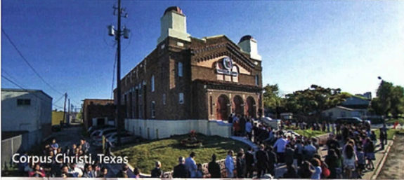
Corpus Christi, Texas