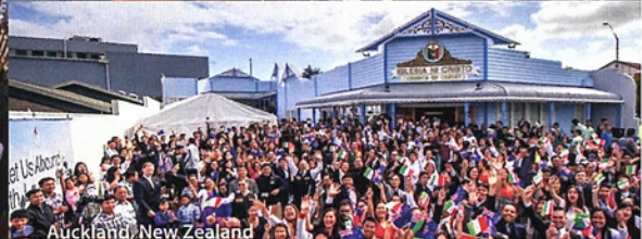
Auckland, New Zealand