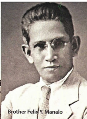
Brother Felix Y. Manalo

BEGINNINGS. The Iglesia Ni Cristo was preached by Brother Felix Y. Manalo, God’s Messenger in these last days, and was registered in the Philippines on July 27, 1914. From its first local congregation in Punta, Sta. Ana, Manila, the Church quickly spread not only throughout the metropolis but also to the neighboring provinces in Luzon and across the islands of Visayas and Mindanao. When Brother Felix Manalo was laid to rest in April 1963, the Church had already established ecclesiastical districts in more than half of all the provinces in the country.